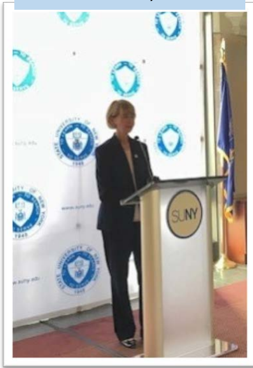
SEFA Campaign Kick-off October 29, 2019