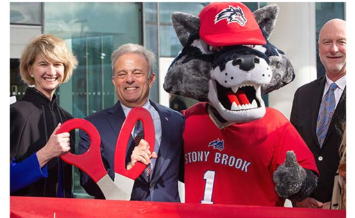
Stony Brook Children's Hospital Ribbon Cutting October 17, 2019