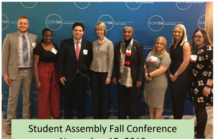
Student Assembly Fall Conference November 15, 2019