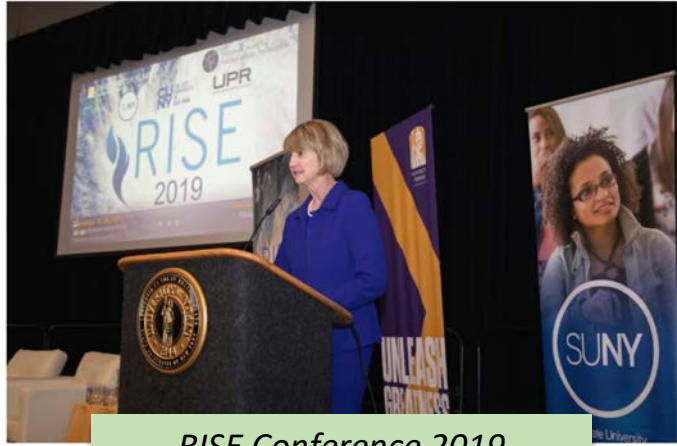
RISE Conference 2019 November 18, 2019