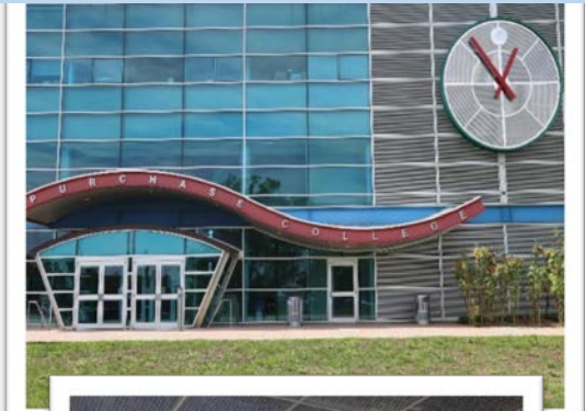
SUNY Purchase Building Tour October 31, 2019