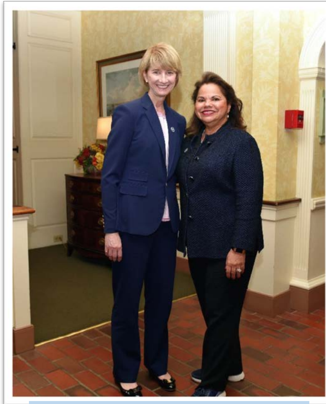
Student Success Conference October 29, 2019